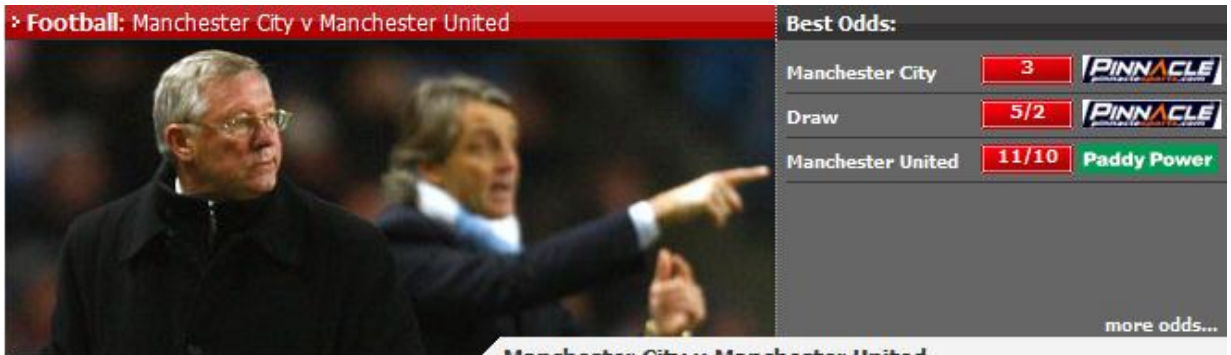
Manchester City v Manchester United

Bet on The Snooker World Championship now!